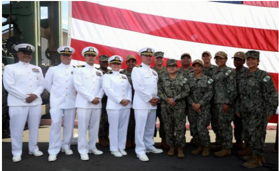
NMFP Unit Deployment Cell and NEMWDC personnel at establishment of the new command at Camp Pendleton, California.

Navy Medicine has established the NEMWDC at Camp Pendleton, replacing the Naval Expeditionary Medical Training Institute (NEMTI). NEMWDC, now under Naval Medical Forces Pacific (NMFP), will serve as a center of excellence for unit-level training, focusing on advanced trauma care skills and certifying expeditionary medical platforms. The establishment of the new command marked a strategic transformation in Navy Medicine's approach to combat trauma readiness and operational medical support by shifting the focus of training and development to be more relevant to operational mission sets. NEMWDC's goal is to assist in the delivery of trained and certified medical units capable of supporting various forces in any environment by 2027. The