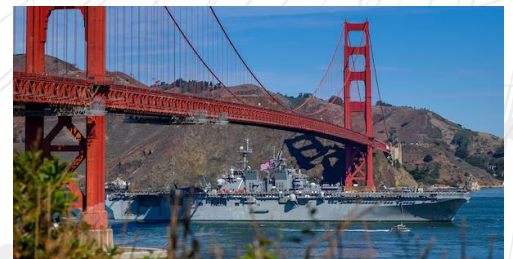
USS Tripoli arrives for San Francisco Fleet Week 2024

For more information on the 2024 San Francisco Fleet Week, please view the link here .